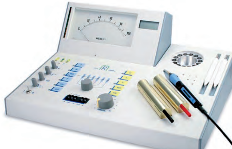
Traditional EAV device

EAV methodology has been used for over 50 years around the world.